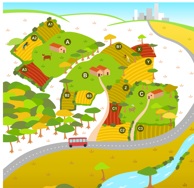
Fig. 1. The multilevel approach to linking households and landscape characteristics. Households have individual access to homestead areas (A, B, and C: level 1) and agricultural fields (A1–A3; B1–B3, C1–C3: level 2) surrounding the homestead. These levels should be linked to a single household. Households will also make use of common pool resources (level 3) around the village, which can be linked to multiple households. The wider regional level (level 4) considers infrastructure access. X, Y, and Z indicate fields that are adjacent to multiple households or no households, which would be split using our current method.

The poorest households were characterized by a small building size (level 1), a relatively large proportion (almost half) of bare agricultural land in level 2 and bare ground in level 1 (Fig. 2). If a household had less than 43% bare ground within the homestead area, but with less than 163 growing days in the year, it was classified in the poorest household category. Poor households that had a large building size (37/92) had less than 21% of the agricultural land planted in September, but experienced over 6 y of below-average growing periods during the 14-y time series of Normalised Difference Vegetation Index (NDVI) and had over 16% of the common pool resource buffer (level 3) covered in homestead areas. Overall, 60% (55 households of a total of 92) of group 1 households, 31% (29 households of 92) of group 2 households and only 9% of group 3 households had a building size under 140 m 2 .