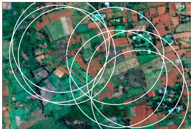
Fig. 3. The single-level approach to linking satellite and household data often uses a single radial buffer zone. This can be problematic as it results in overlapping regions and multiple pixels being assigned to multiple households when households would not have access to some land parcels such as multiple homesteads.

Future Work. The methodology developed here would need to be tested in multiple places, with different spatial arrangements of homes and agricultural fields, configurations of common resource areas, road networks, and market access. The approach still lacks detailed land tenure information but could vary the size of level 3 based on land ownership. Not all households have the same access to land and common pool resources across the landscape (25). Local and regional institutions can also impact the ways different actors access and utilize natural resources (26). Therefore, future work should examine how protected land areas, tenure rights, and institutional arrangements could be integrated into the multilevel approach. This could result in more accurate links between individual households and the parcels of land which they use. Developments in data and technology availability since the household survey was collected in 2005 provide significant future opportunities that should be explored for mapping wealth, health, and life on land. We